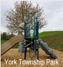
York Township Park