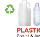
PLASTIC Bottles & Jugs 1, 2 & 5