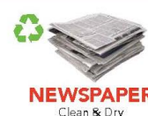
NEWSPAPER Clean & Dry No Food Contact