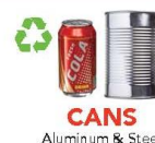
CANS Aluminum & Steel